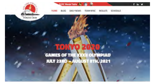
Our Team in Tokyo - News, Results, Updates - Your Single NYAC Source

www.nyactokyo2020.com, or clicking here . Visit the micro-site regularly as updates are frequent and exciting!